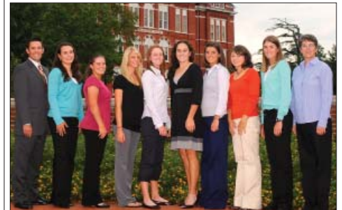
2010 (t-11th) Country Club of Landfall Wilmington, N.C. Host: North Carolina-Wilmington