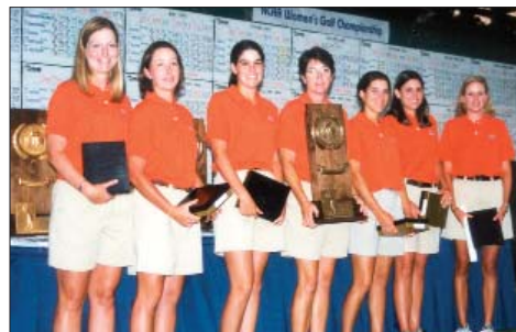
2001 (4th) Mission Inn Golf and Tennis Resort Howey-in-the-Hills, Fla. Host: Stetson