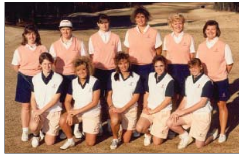
1990 (8th) Arthur Hills Course at Palmetto Dunes Hilton Head, S.C. Host: South Carolina