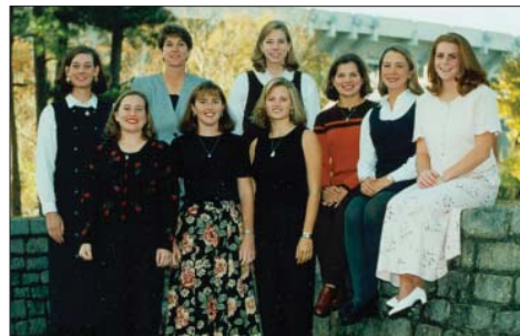
1998 (19th) University Ridge Golf Course Madison, Wis. Host: Wisconsin