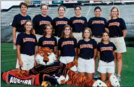
2003 (9th) Kampen Course West Lafayette, Ind. Host: Purdue