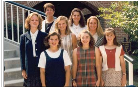
1996 (18th) La Quinta Country Club (Dunes Course) La Quinta, Calif. Host: UCLA