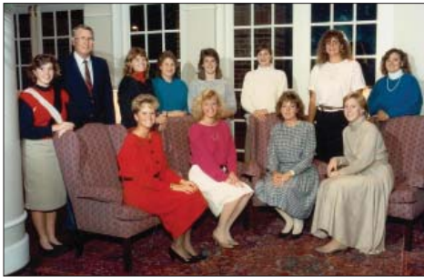
1989 (13th) Stanford Golf Course Palo Alto, Calif. Host: Stanford