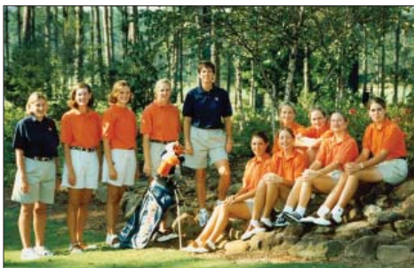
2000 (6th) Crosswater Club Sunriver, Ore. Host: Oregon State