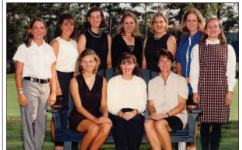
1999 (t-15th) Tulsa Country Club Tulsa, Okla. Host: Tulsa