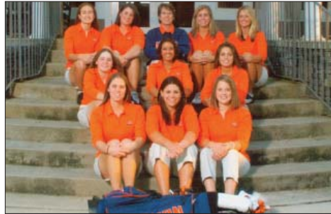
2005 (3rd) Sunriver Course Bend, Ore. Host: Oregon