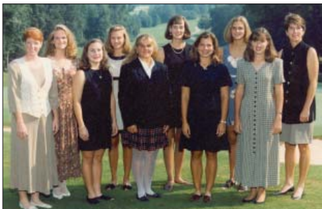
1997 (13th) The Scarlet Course Columbus, Ohio Host: Ohio State