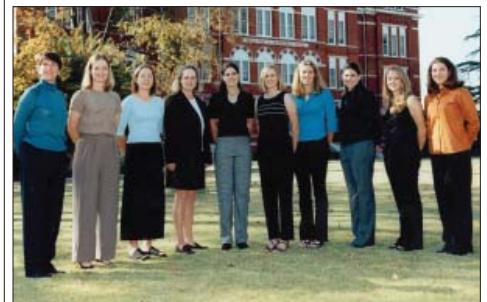
2002 (t-2nd) Washington National Golf Club Auburn, Wash. Host: Washington