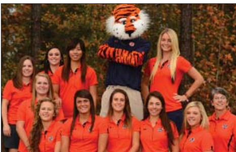
2013 (6th) University of Georgia Golf Course Athens, Ga. Host: Georgia