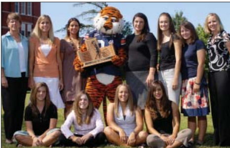
2007 (9th) LPGA International Daytona Beach, Fla. Host: Central Florida