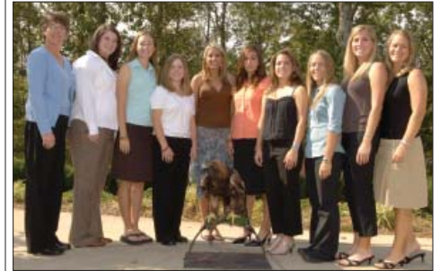
2006 (12th) Ohio State Scarlet Course Columbus, Ohio Host: Ohio State