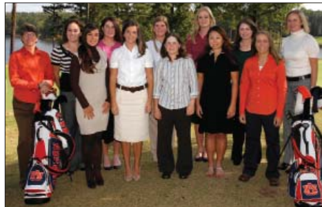
2008 (t-12th) New Mexico Championship Golf Club Albuquerque, N.M. Host: New Mexico