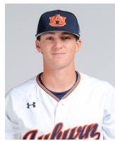
37 MASON LAND