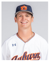
21 TRACE BRIGHT