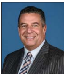
Bruce Pearl Head Coach