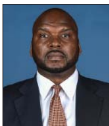
Chuck Person Associate Head Coach