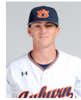
37 MASON LAND