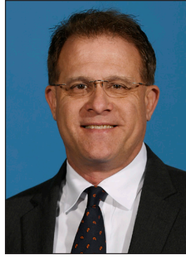
Gus Malzahn Head Coach