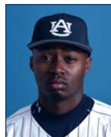
4 DAINO DEAS