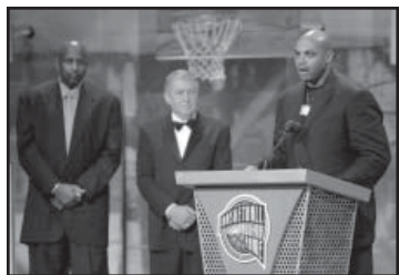
One Auburn player has been named to the Basketball Hall of Fame: 2006.....Charles Barkley