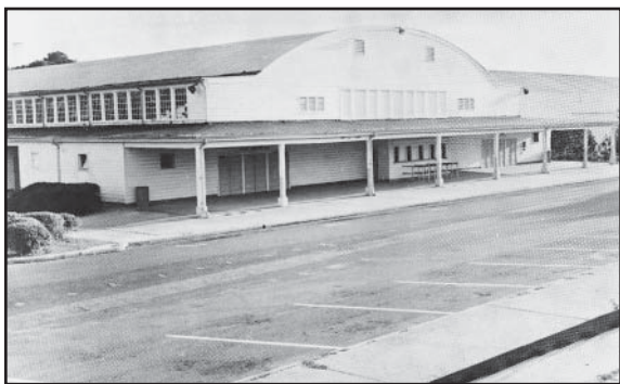
The Sports Arena, Auburn's home from 1946-69.

It was easier to feel close to college basketball players back then. Games weren't televised -- except for the one in 1960 -- so fans saw players only in person, usually close to the court in a small gym. We never saw the likes of Oscar Robertson or Jerry West, but the best in the SEC came to the Sports Arena -- Bailey Howell from Mississippi State, Roger Kaiser from Georgia Tech, Cotton Nash from Kentucky, Donnie Kessinger from Ole Miss. And later, Clyde Lee from Vanderbilt, Louie Dampier and Pat Riley from Kentucky, Pistol Pete Maravich from LSU.