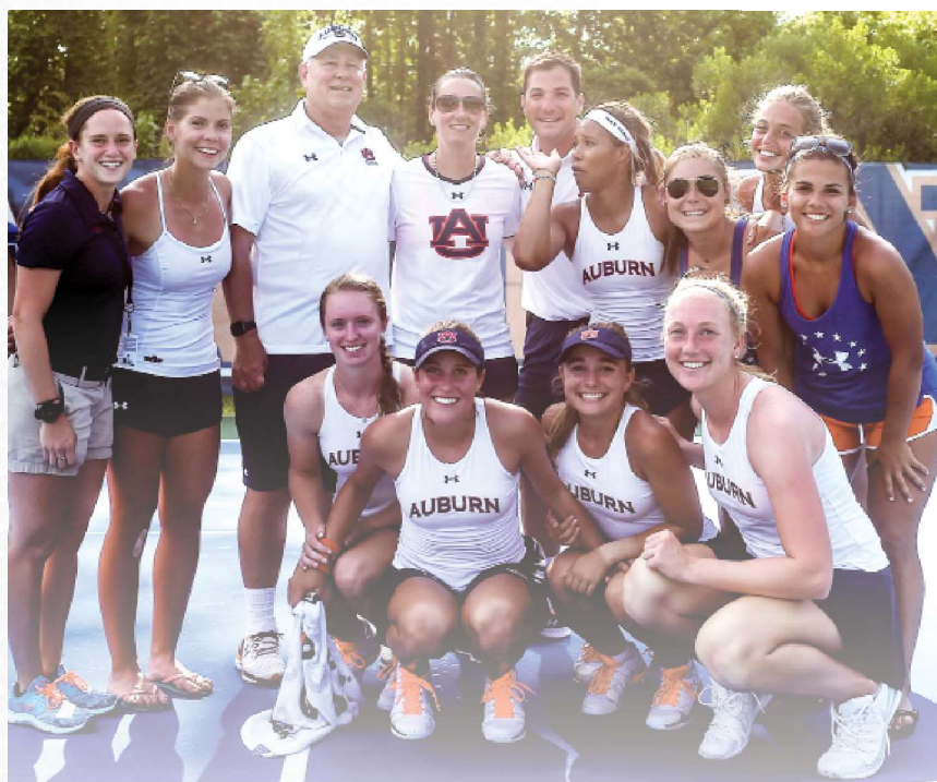
In 2016, Auburn hosted a regional and advanced to the NCAA Tournament Round of 16 for the first time in school history. The Tigers finished with a 24-8 (9-4 SEC) record on the season.