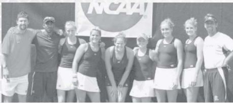
In 2007, Auburn went 14-10, were co-champions of the SEC Western Division and qualified for the NCAA Championships.