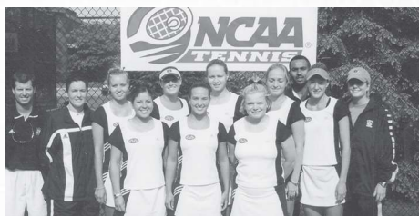
In 2002, Auburn posted a 15-9 record and captured the SEC West Division title. The squad finished the season ranked 31st nationally and appeared in the NCAA Championships.