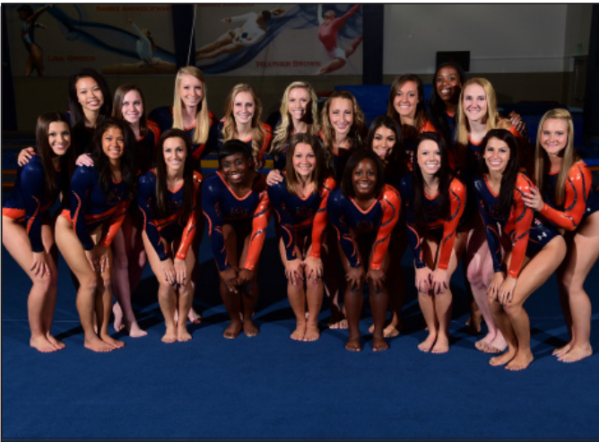
2015 AUBURN GYMNASTICS TEAM