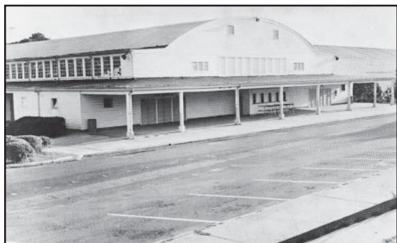
The Sports Arena, Auburn's home from 1946-69.

It was easier to feel close to college basketball players back then. Games weren't televised -- except for the one in 1960 -- so fans saw players only in person, usually close to the court in a small gym. We never saw the likes of Oscar Robertson or Jerry West, but the best in the SEC came to the Sports Arena -- Bailey Howell from Mississippi State, Roger Kaiser from Georgia Tech, Cotton Nash from Kentucky, Donnie Kessinger from Ole Miss. And later, Clyde Lee from Vanderbilt, Louie Dampier and Pat Riley from Kentucky, Pistol Pete Maravich from LSU.