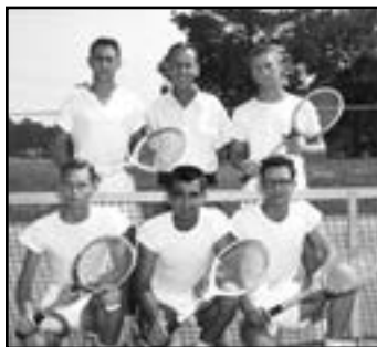
Auburn's 1951 team: