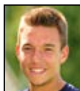
Andreas Mies 2012 - Doubles