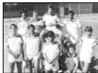
The 1983 SEC Champions, AU's first conference champion men's tennis team.