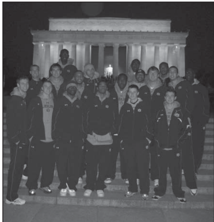
The Auburn Tigers also visited the Lincoln Memorial during its road trip to Washington, D.C., as it defeated George Washington 74-70 in the BB&T Classic in the Verizon Center.