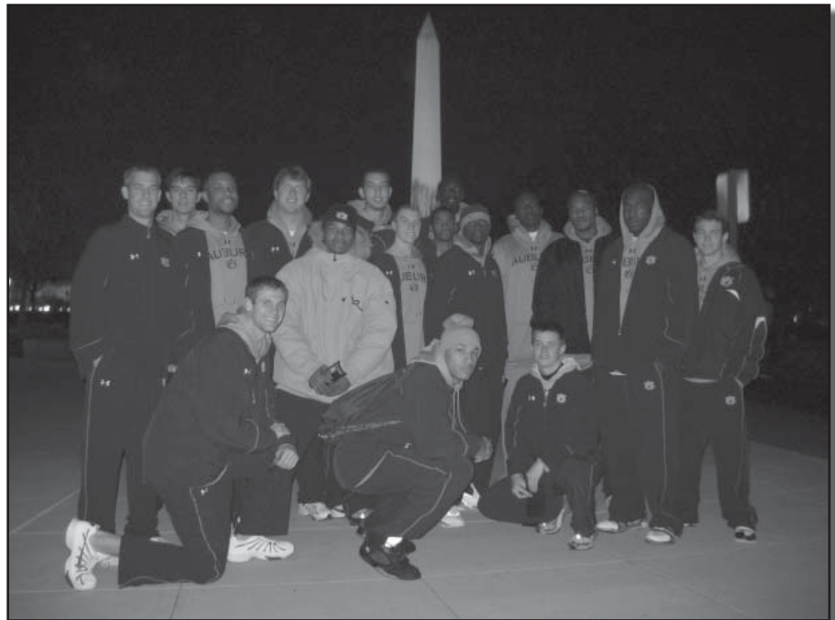
The Auburn Tigers pose in front of the Washington Monument during its road trip to Washington, D.C., as it defeated George Washington 74-70 in the BB&T Classic in the Verizon Center.