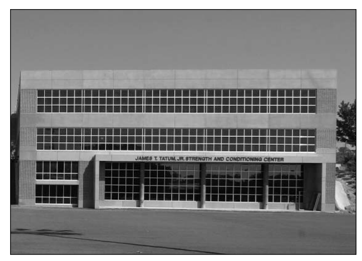
The James T. Tatum Strength and Conditioning Center (bottom) and Lowder Academic Center (top two floors)

The carpeted locker room has wooden lockers for each student-athlete, individually stalled showers, restrooms and a state-of-the-art stereo system.