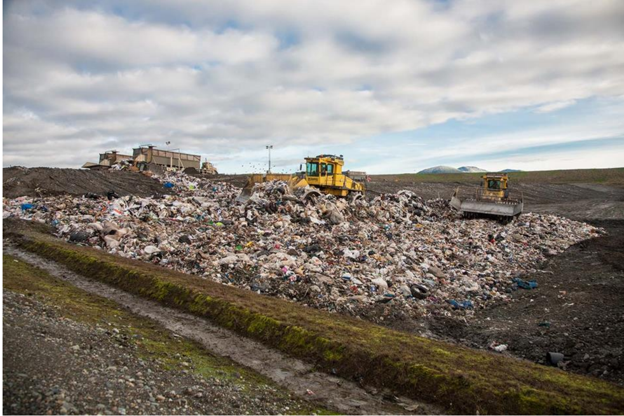
Cedar Hills Landfill, Maple Valley WA