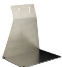
A813 Table Top Stand †