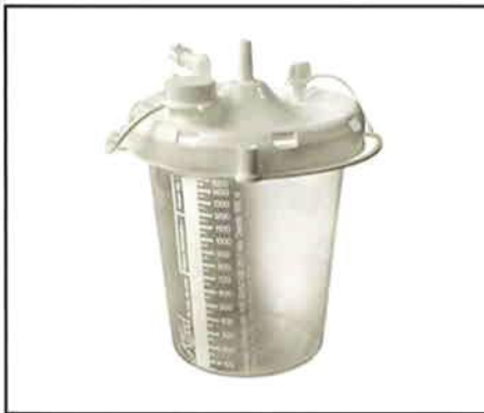
Disposable Collection Canister