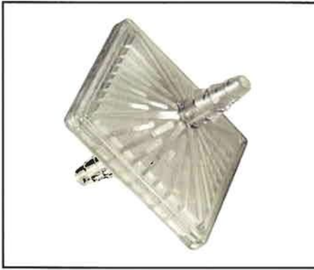
Disposable Hydrophobic/Bacteria Filter