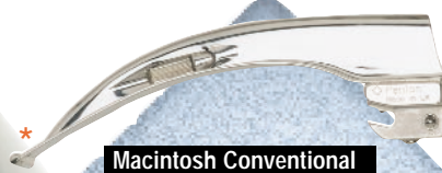
Macintosh Conventional Size 1 Infant 52118 Size 2 Child 52117 * Size 3 Adult 52116 Size 4 Large 52115