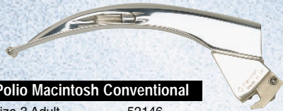
Polio Macintosh Conventional Size 3 Adult 52146