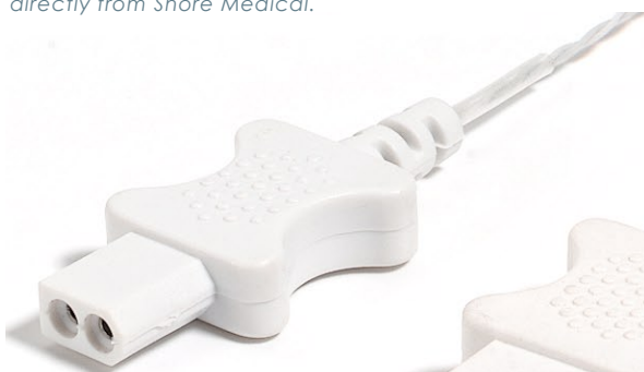
400 series sensor

All the devices shown here are prescription products and must be obtained from a licensed homecare provider or physician. Patients cannot purchase directly from Shore Medical.