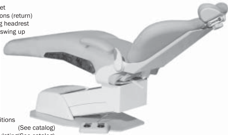
Shown: 5000T Hydraulic patient chair with plush upholstery and Florentine burl trim