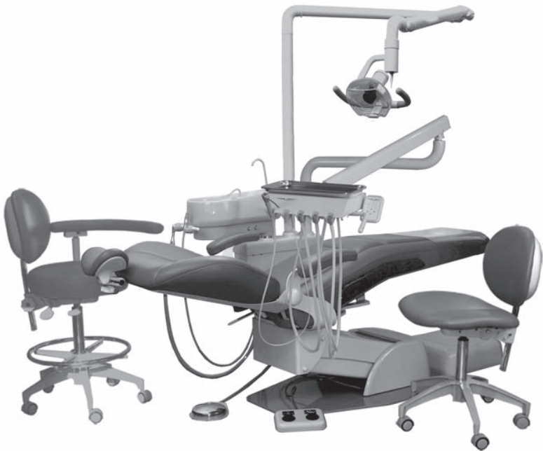
Shown: 6000 contoured cuspidor package with WeStarlight VIII, Ultra operator stools, and the 2001 Electro-mechanical patient chair in plush upholstery option