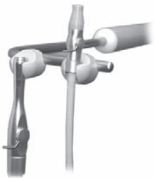
6010 Assistant Instrumentation