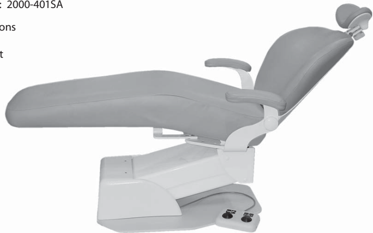
Shown: 2001 Electro-mechanical patient chair with asepsis upholstery and optional covered arms