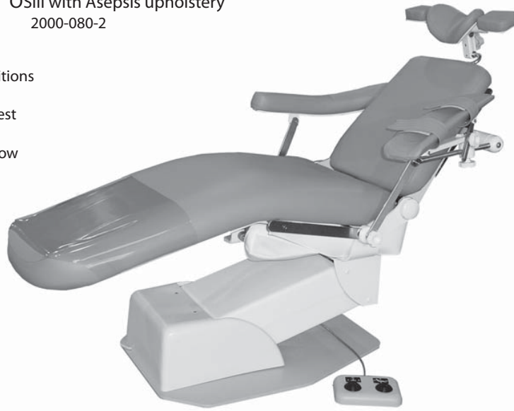
Shown: OSIII with optional eight way I. V. arm and Chinner Headrest