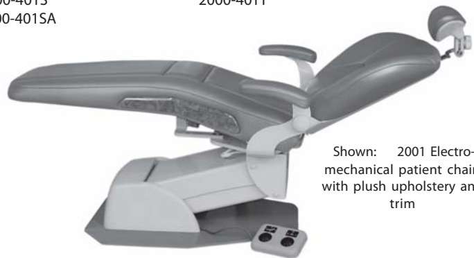
Shown: 2001 Electro-mechanical patient chair with plush upholstery and trim