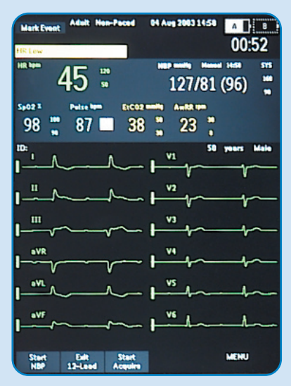
In 12-lead preview mode, 12 waves are viewable on-screen, in addition to numeric vital sign values.

A typical monitoring view shows some basic patient information, the date, time and battery status. Next are the numerics and waveforms. The bottom half of the screen shows additional monitoring numerics followed by their waveforms, and soft keys for customizing the display, setting and responding to alarms, and selecting parameters to view additional monitoring data.