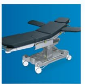
Surgery Table Positioning Built-in