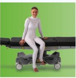
Adjustable Height Low: 24" High: 40"