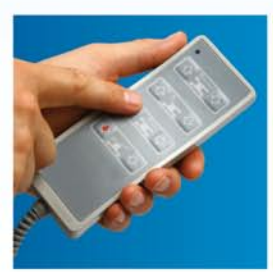
Remote Control Powered version only.