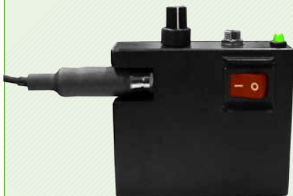
Increased Power and Comfort 7.5 Hour/ 6 oz. C3 Lithium Pack with Intensity Control