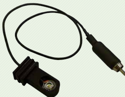
Never a Lamp to Replace 3-watt LED with a 50,000 hour life