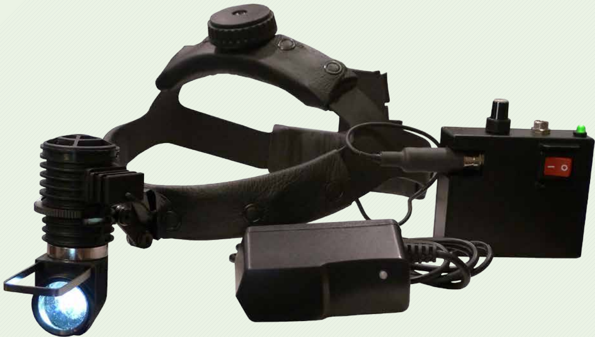
DRE Xavier C3 Portable LED

The full system shown here with headband, LED headlight, battery pack and charger.