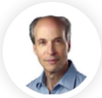
PROF. ROGER KORNBERG Nobel Prize Winner in Chemistry (2006), Prof. at Stanford