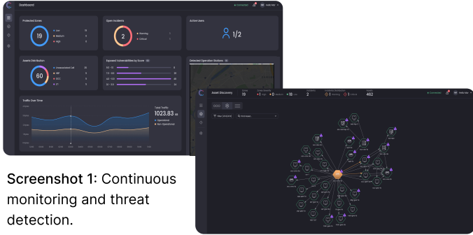
Screenshot 1: Continuous monitoring and threat detection.