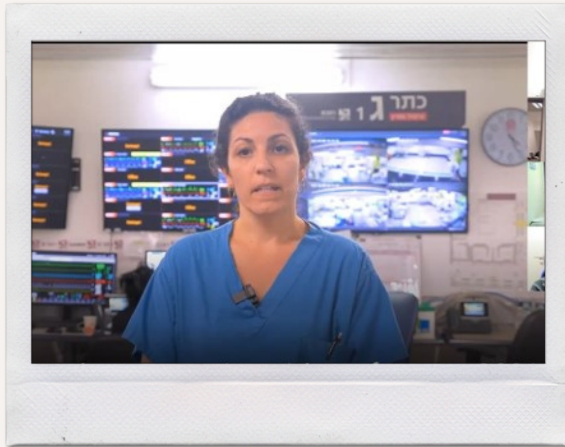
Testimonies of nurses from Corona hospital units