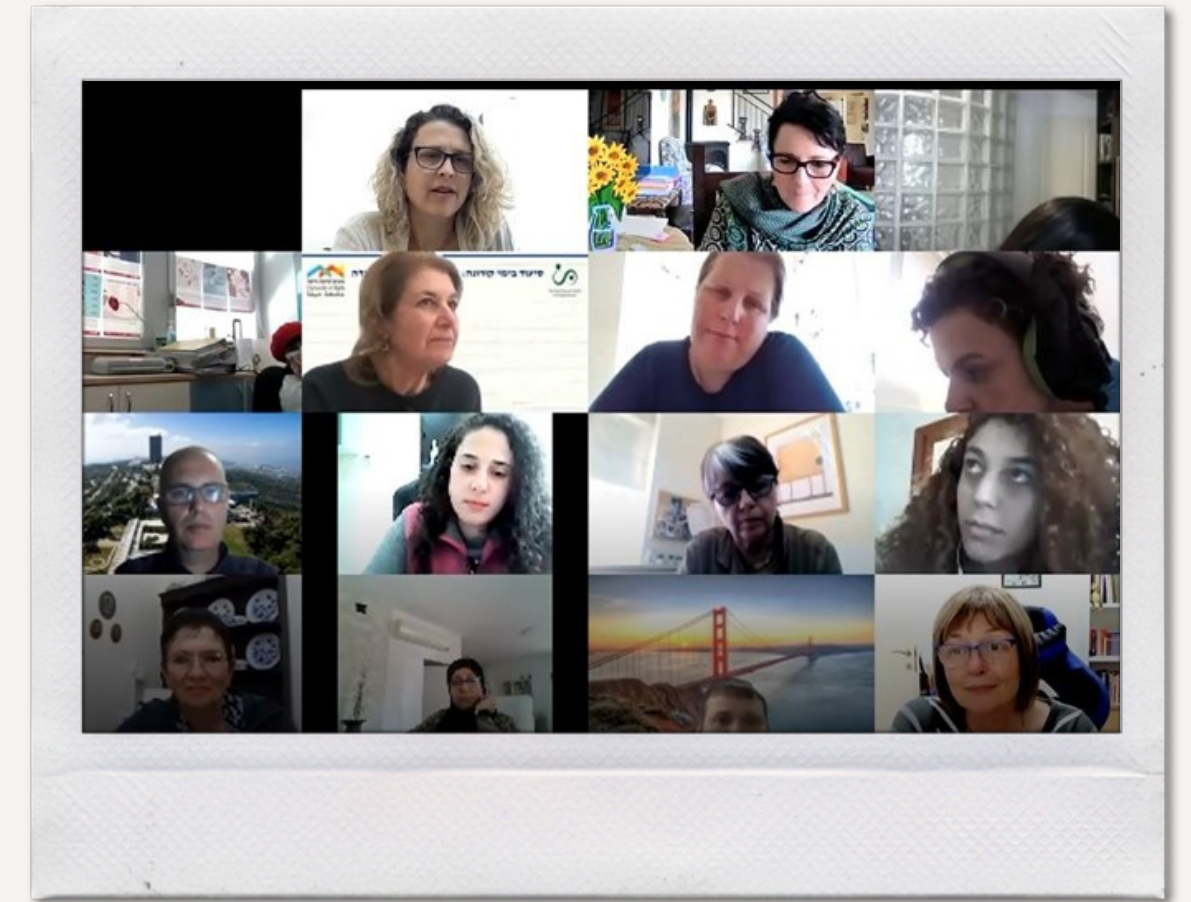
Over 200 participants from academia, nursing leadership and administration and in clinical practice attended