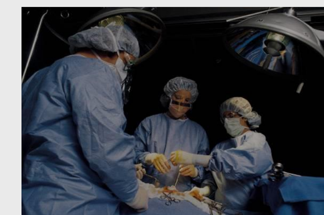
Figure 2. Label in 24pt Arial.