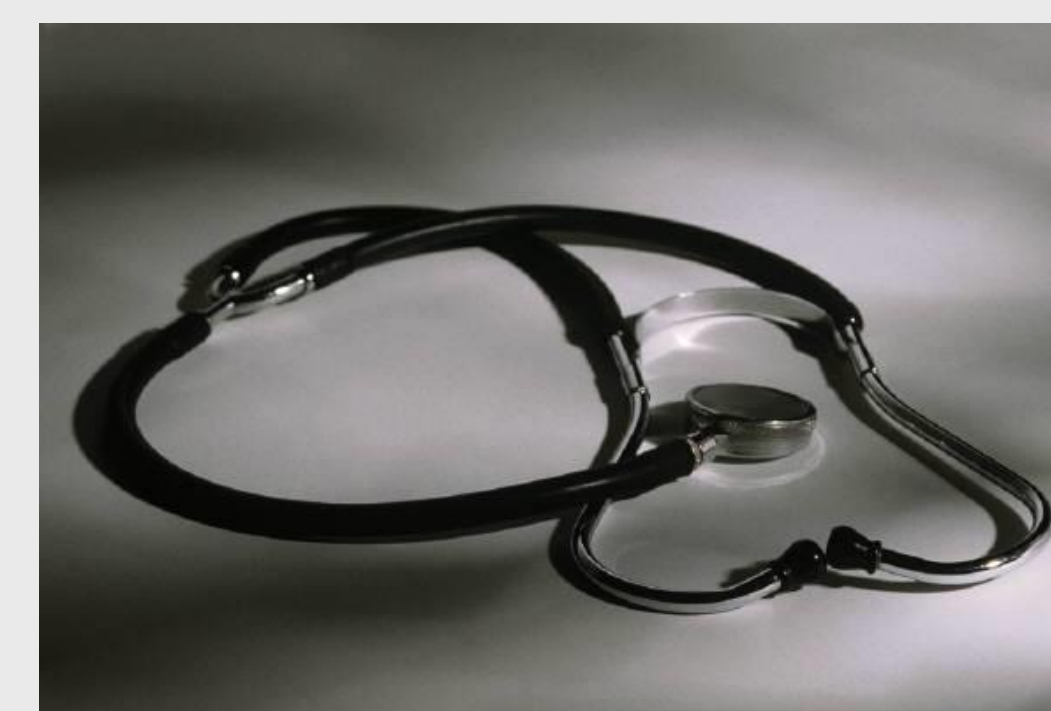
Figure 1. Label in 24pt Arial.

We print directly from PowerPoint so your poster will look just like it does on screen. Other printing outlets (Kinko's, for example) convert your file to another format prior to printing. This can result in elements shifting, loss of effects, or altered colors. By printing from the same version of PowerPoint that your file was created in, Genigraphics gives you the most accurate reproduction available.