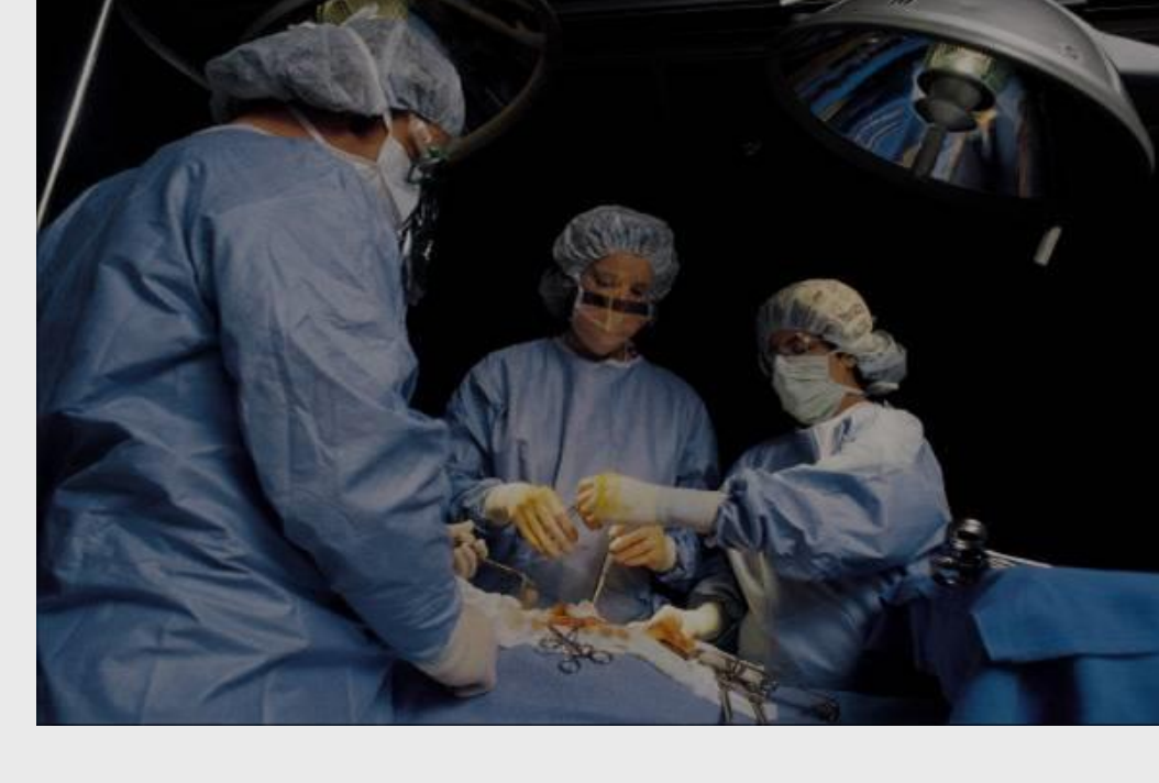
Figure 2. Label in 24pt Arial.