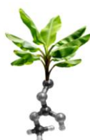
Novel Production Technologies