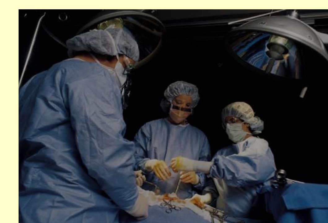
Figure 2. Label in 24pt Arial.