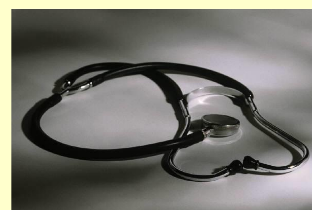
Figure 1. Label in 24pt Arial.

We print directly from PowerPoint so your poster will look just like it does on screen. Other printing outlets (Kinko's, for example) convert your file to another format prior to printing. This can result in elements shifting, loss of effects, or altered colors. By printing from the same version of PowerPoint that your file was created in, Genigraphics gives you the most accurate reproduction available.