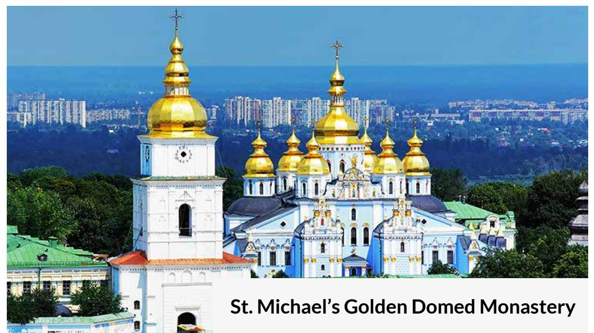
St. Michael's Golden Domed Monastery

Explore the Saint Michael's Golden-Domed Cathedral and Monastery. Also learn about the city's legends from the 12th century, the Mongol attacks, prominent architectural changes that took place and all about the restoration of the 1990s. Witness the splendour of St. Sophia Cathedral. This UNESCO World Heritage Site has 13 golden cupolas and is inspired by the Hagia Sophia in Constantinople.