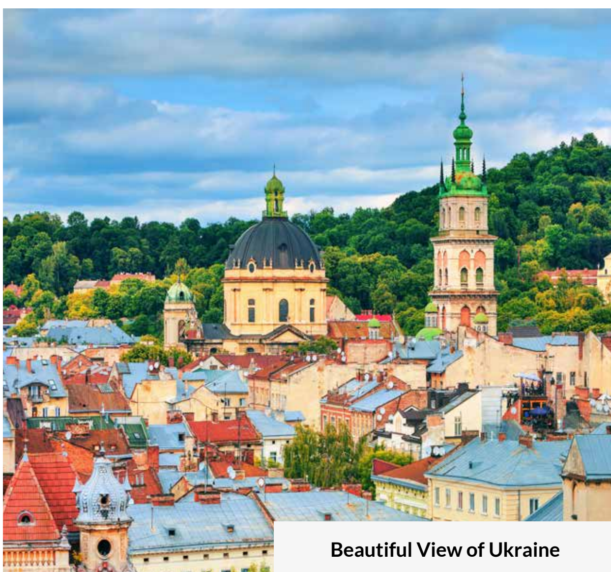
Beautiful View of Ukraine

Overnight stay in the luxurious comforts of your hotel.