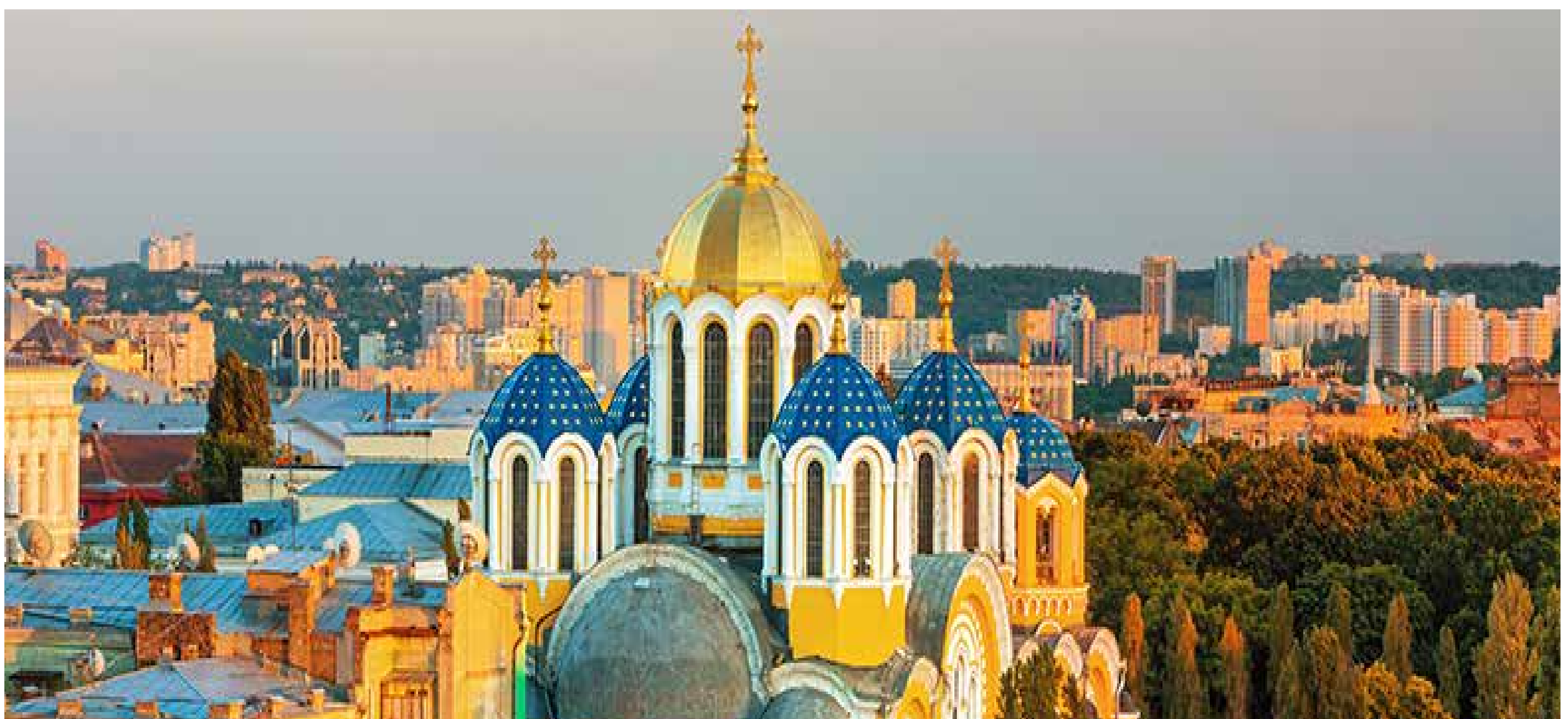
St. Volodymyr Cathedral

Explore the Saint Michael's Golden-Domed Cathedral and Monastery. Also learn about the city's legends from the 12th century, the Mongol attacks, prominent architectural changes that took place and all about the restoration of the 1990s. Witness the splendour of St. Sophia Cathedral. This UNESCO World Heritage Site has 13 golden cupolas and is inspired by the Hagia Sophia in Constantinople.