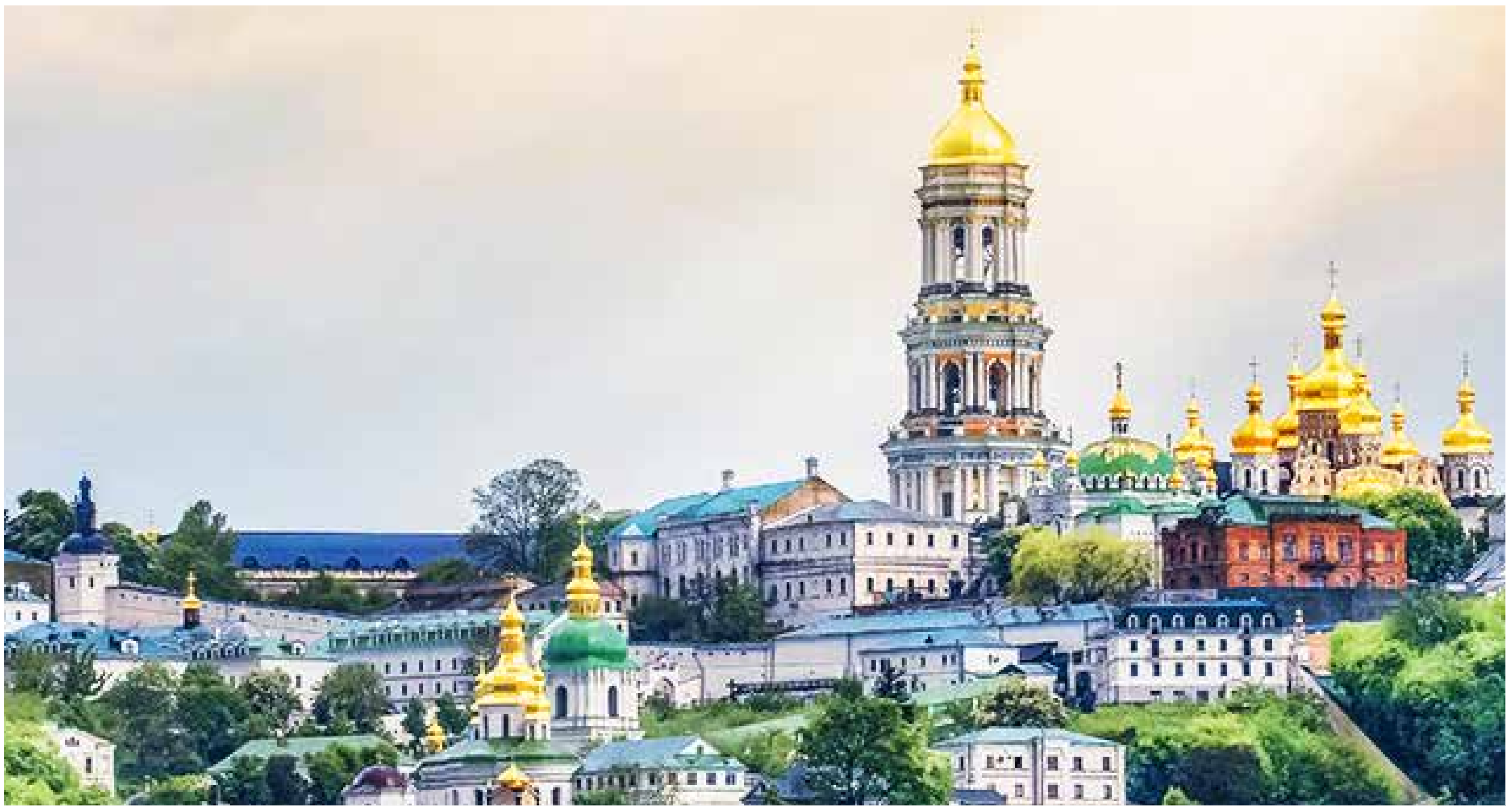
Kyiv Pechersk Lavra

Spend the evening at leisure or explore the city on your own. Enjoy an overnight stay at the hotel in Kyiv.