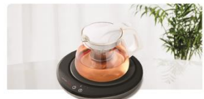
Drinks [1st Step / 2nd Step]