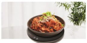
Stir-fried dishes [1st Step / 2nd Step]