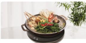
Stew / Soup [3rd Step]