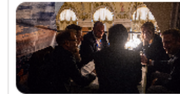
EnergyWeek 2024 Matchmaking 12-14 March 2024 Vaasa, Finland

The better the participant profile, the more meeting invitations you will receive!