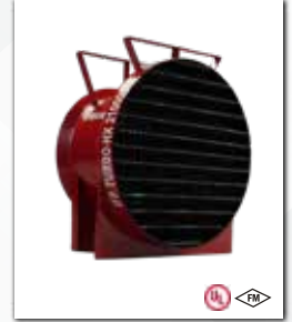
HIGH EXPANSION FOAM GENERATOR UPTO 1000 LPM