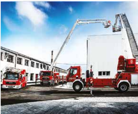
AERIAL LADDER PLATFORM