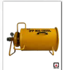
MEDIUM EXPANSION FOAM GENERATOR