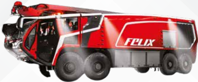
AIRPORT CRASH FIRE TENDER