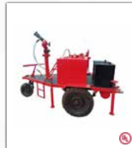
TRAILOR MOUNTED FOAM WATER MONITOR