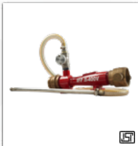
INLINE INDUCTOR 400 LPM TO 2500 LPM