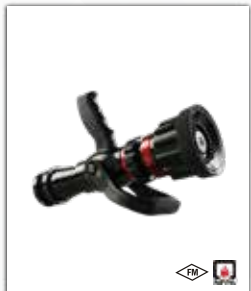
PISTOL GRIP NOZZLE