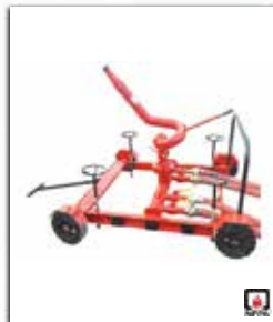
PORTABLE WATER MONITOR TROLLEY