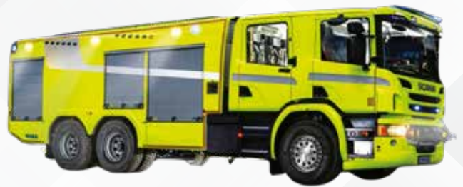
MULTIPURPOSE FIRE TENDER