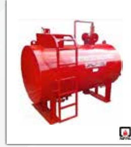
ATMOSPHERIC FOAM TANK