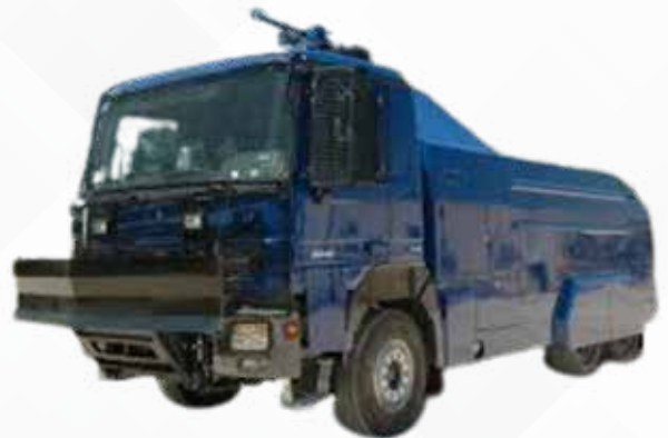
RIOT CONTROL VEHICLE