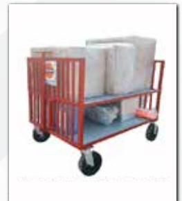
EMERGENCY TROLLEY AS PER OISD-STD-117