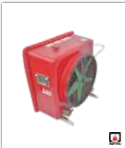
HIGH-EXPANSION FOAM GENERATOR (STANDARD)