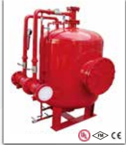
VERTICLE BLADDER TANK