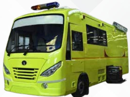
MOBILE COMMAND POST