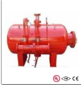
HORIZONTAL BLADDER TANK