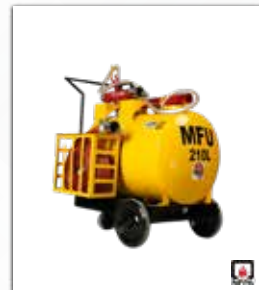
MOBILE FOAM TROLLEY