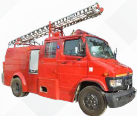
ULTRA HIGH PRESSURE WATER MIST TENDER