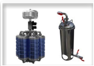
AQUALOOP installation kit for water treatment