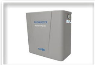
RAIMASTER control units