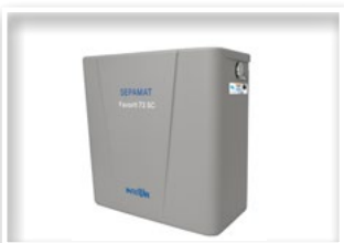
SEPAMAT system separator

Further products: Tanks • Pumps • Accessories