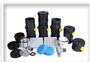
PLURAFIT manhole & filter kit