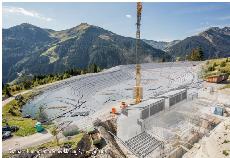
Saalbach-Hinterglemm Snow-Making System, Austria