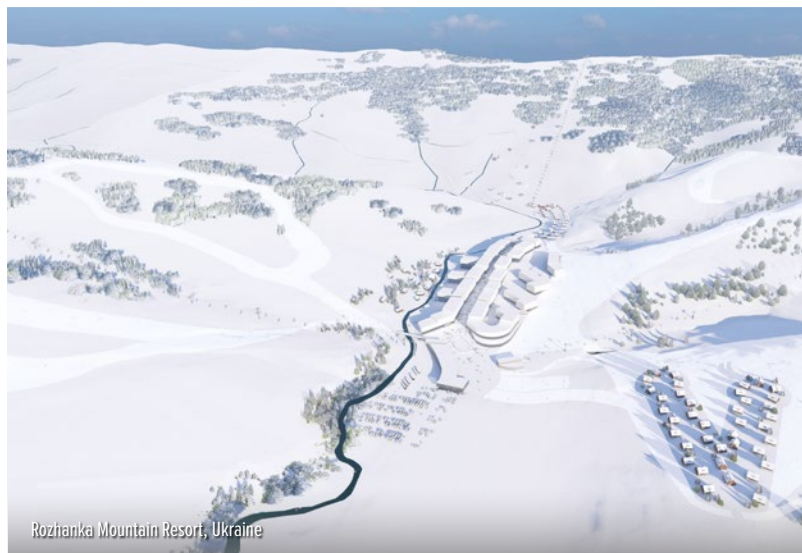
Rozhanka Mountain Resort, Ukraine