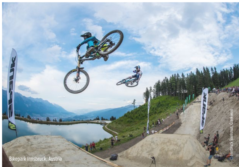
Bikepark Innsbruck, Austria