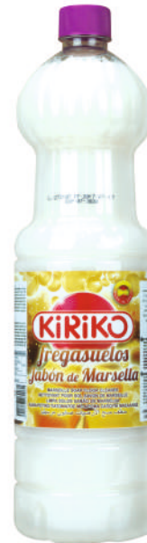
MARSEILLE SOAP 1,5L 8 Units BOX