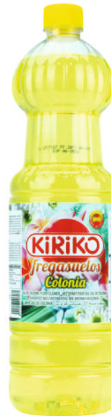
EAU DE COLOGNE 1,5L 8 Units BOX