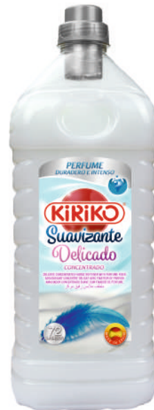
DELICATE 2L 6 Units BOX