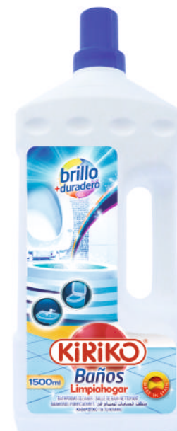
BATHROOM CLEANER 1,5L 9 Units BOX