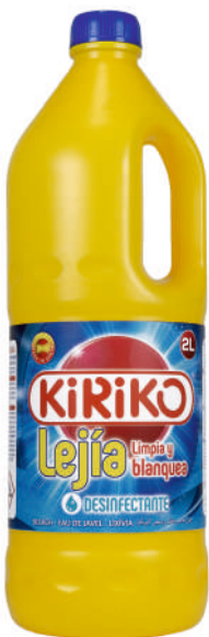
CLEANS AND WHITENS