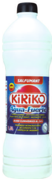
AQUAFORTIS 1,5L 8 Units BOX