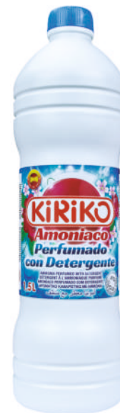
PERFUMED AMMONIA WITH DETERGENT 1,5L 8 Units BOX