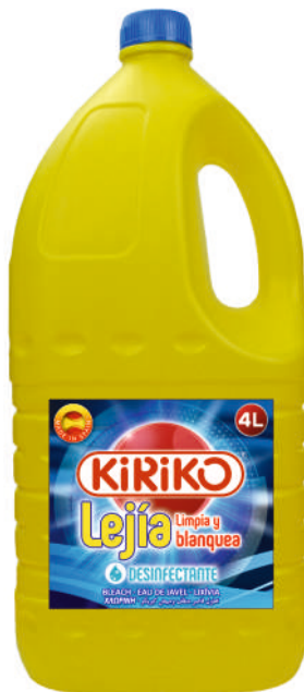
CLEANS AND WHITENS