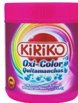
OXI COLOR / STAIN REMOVER COLOR CLOTHES