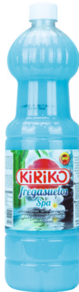
SPA 1,5L 8 Units BOX