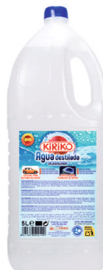
DE IONISED WATER