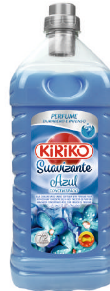
BLUE 2L 6 Units BOX