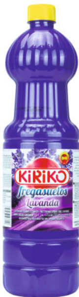
LAVENDER 1,5L 8 UDS CAJA