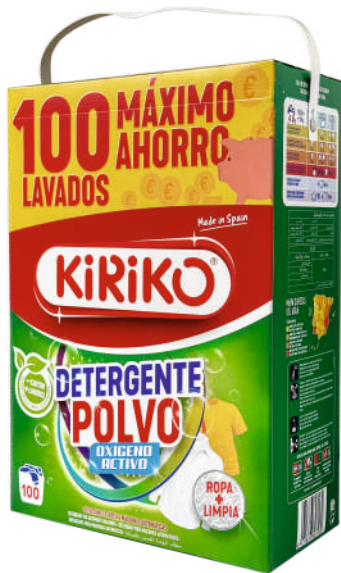
WASHING POWDER FOR WASHING MACHINE