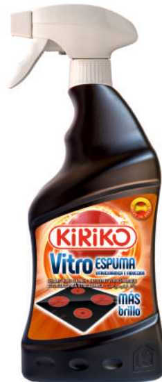
CERAMIC HOBS CLEANER