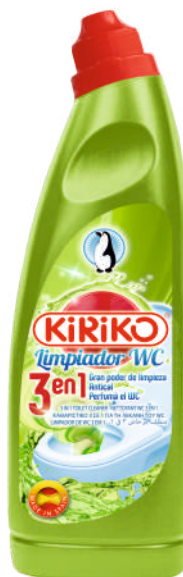
WC 3 IN 1 750 ml 16 Units BOX