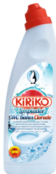
WC CLEANER WITH BLEACH 750 ml 16 Units BOX