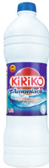
AMMONIA 1,5L 8 Units BOX