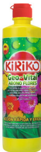
FLOWERS GEO VITAL