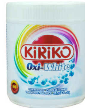
OXI WHITE / STAIN REMOVER WHITE CLOTHES