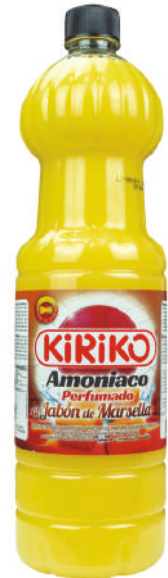
PERFUMED AMMONIA MARSEILLE SOAP 1,5L 8 Units BOX