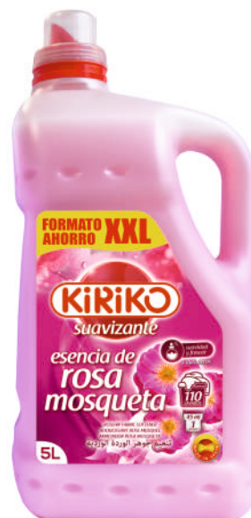
ROSEHIP 5L 2 Units BOX