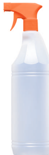
EMPTY SPRAY BOTTLE