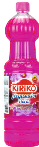
FLORAL 1,5L 8 Units BOX