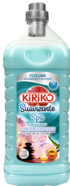
SPA 2L 6 Units BOX