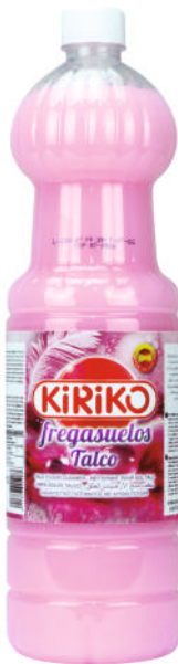
TALC 1,5L 8 Units BOX