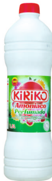
PERFUMED AMMONIA 1,5L 8 Units BOX