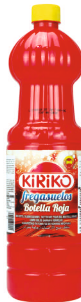
RED BOTTLE 1,5L 8 Units BOX