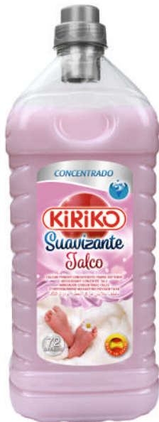
TALC 2L 6 Units BOX