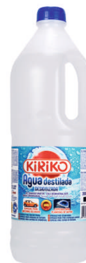
DE IONISED WATER