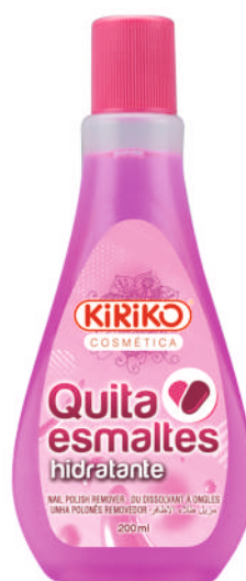
NAIL POLISH REMOVER