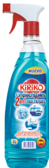
MULTIPURPOSE 2 IN 1