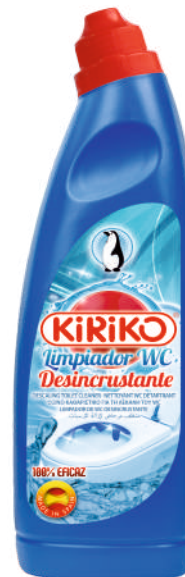
DECALING WC CLEANER 750 ml 16 Units BOX