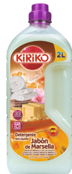
MARSEILLE SOAP 2L 6 Units BOX