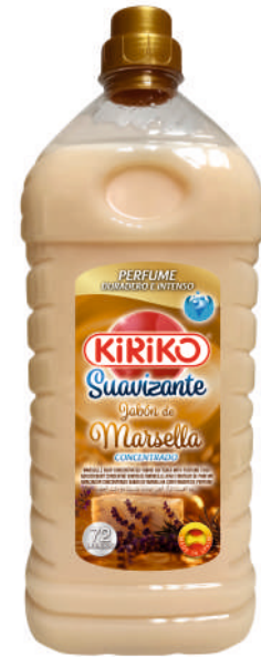
MARSEILLE SOAP 2L 6 Units BOX