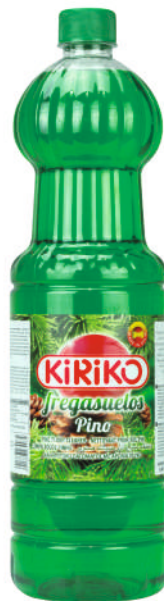
PINE 1,5L 8 Units BOX