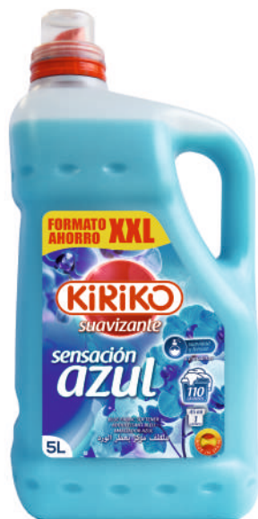
BLUE SENSATION 5L 2 Units BOX