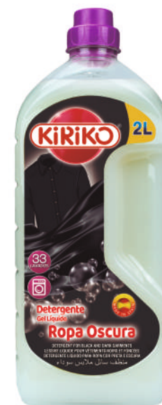
DARK CLOTHE 2L 6 Units BOX