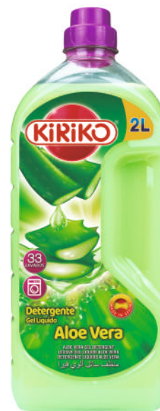
ALOE VERA 2L 6 Units BOX