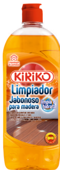
FURNITURE AND WOOD CLEANER