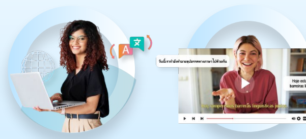
Translation & Localisation