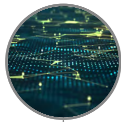
Cyberdefense and intelligence