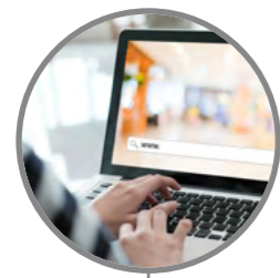
Corporate ICT environments