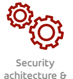
Security achitecture & design