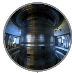
Critical infrastructures protection