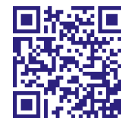
#LeipzigUnlimited testimonial campaign