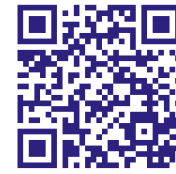
Invest Region Leipzig

Leipzig Region has a strong educational landscape, which is regarded as the backbone of cutting-edge research in Germany. With 16 universities and 63 research centres, Leipzig offers a wide range of training opportunities that are specifically tailored to the needs of regional growth industries. In relevant areas such as energy and environmental technology, biotechnology and the digital economy, companies benefit from close links with leading institutions and specialised networks that promote innovation and knowledge transfer and support the development of new technologies.