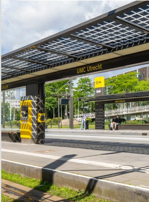
OV Uithoflijn Sustainable comfort on the move. Modular tram shelters with smart shading and solar power.