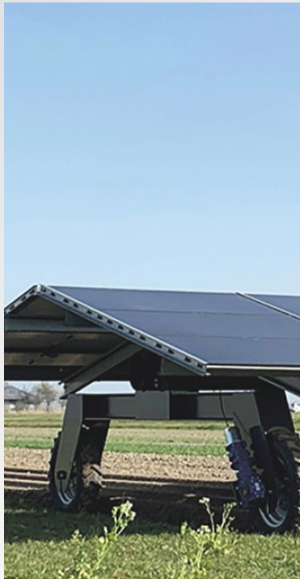
H2arvester Clean energy meets smart farming. An autonomous system harvesting sun and food side by side.