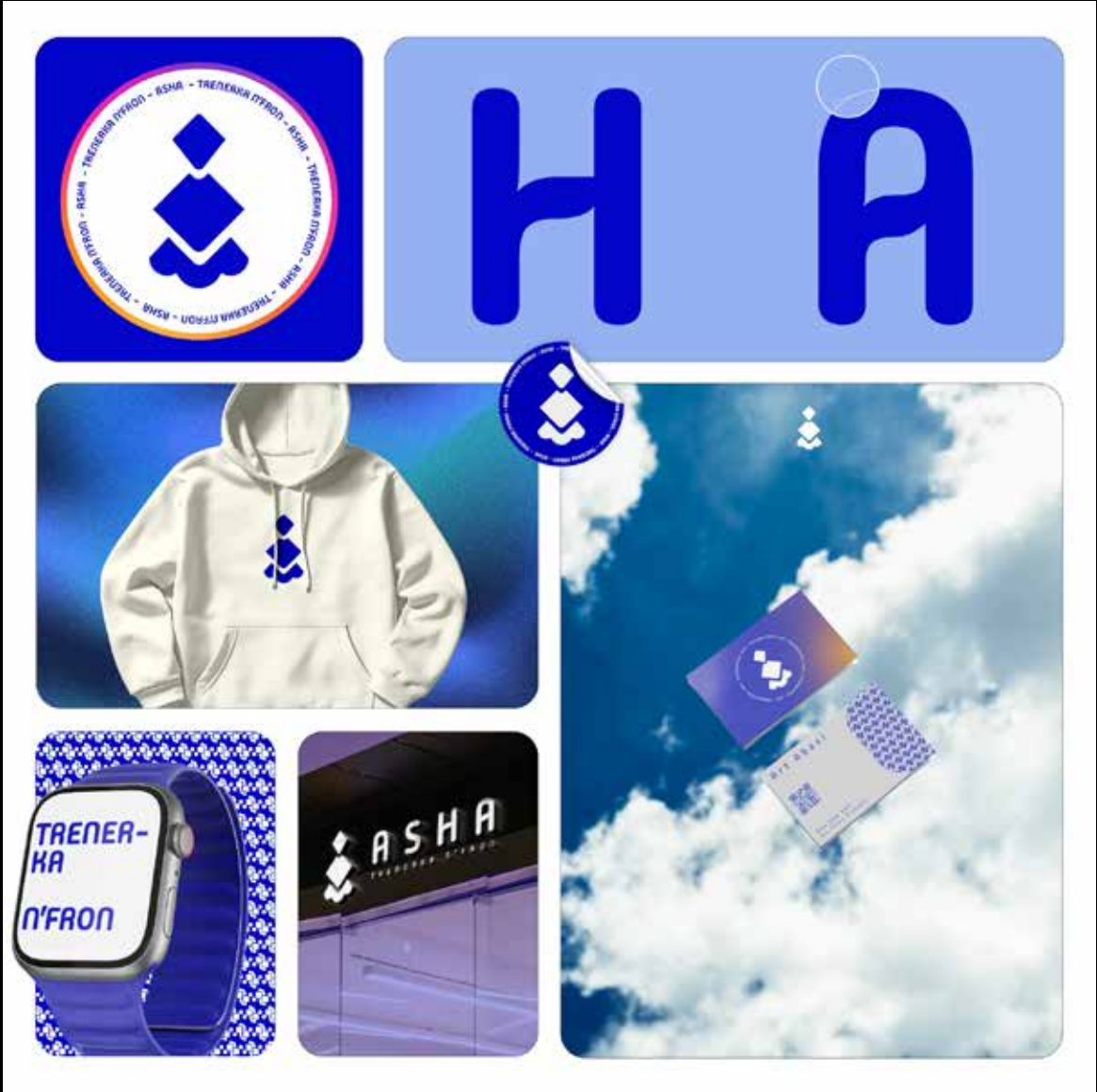
ASHA BRAND IDENTITY