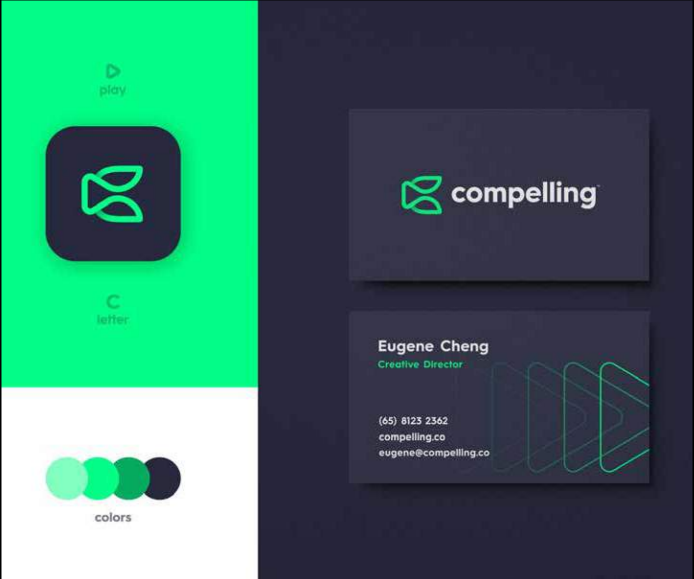
VISIT CARD + BRAND IDENTITY