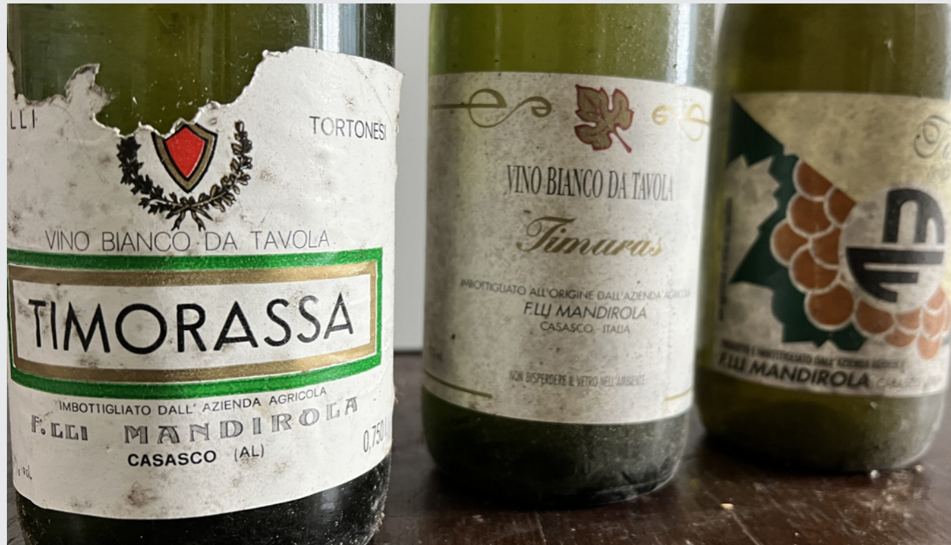
Some of our historical labels.

When Timorasso was an unknown vine variety my father committed body and soul to growing and selling it, with remarkable endurance. With great passion but also with much effort. It was the 80s.