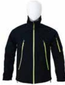
8792 - OLYMPUS PROFLEX SOFTSHELL JACKET