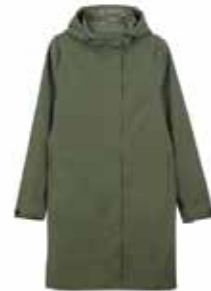
URBAN SHIELD LONG COAT