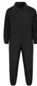
ALL WEATHER WATERPROOF 2-1 JACKET