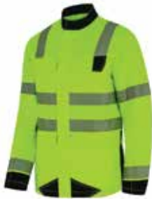
18006 - ROADPRO STRETCH SAFETY JACKET