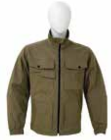
9164 - FLEXCORE SERVICE JACKET