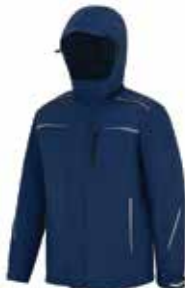
18050 - ALL-WEATHER WATERPROOF 2-IN-1 PERFORMANCE JACKET