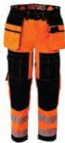
9146 - HI FLEX PRO VISIBILITY CARGO PANT