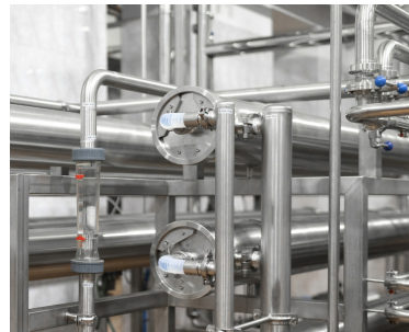
Definition of separation and purification unit operations applied to industrial biotechnologies