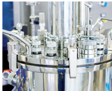
Processing microorganisms (bacteria, yeast, fungi, microalgae, etc.) in solid or liquid media