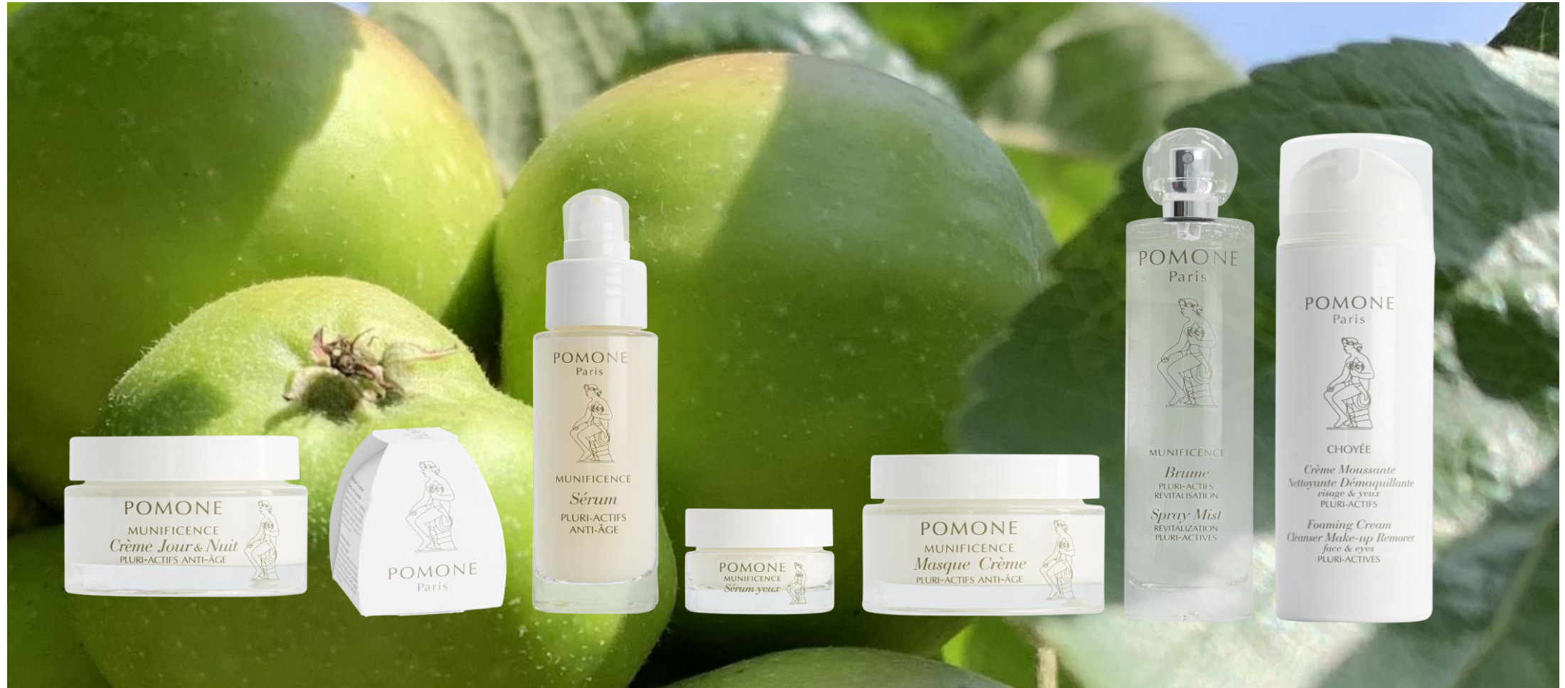
DAY & NIGHT CREAM