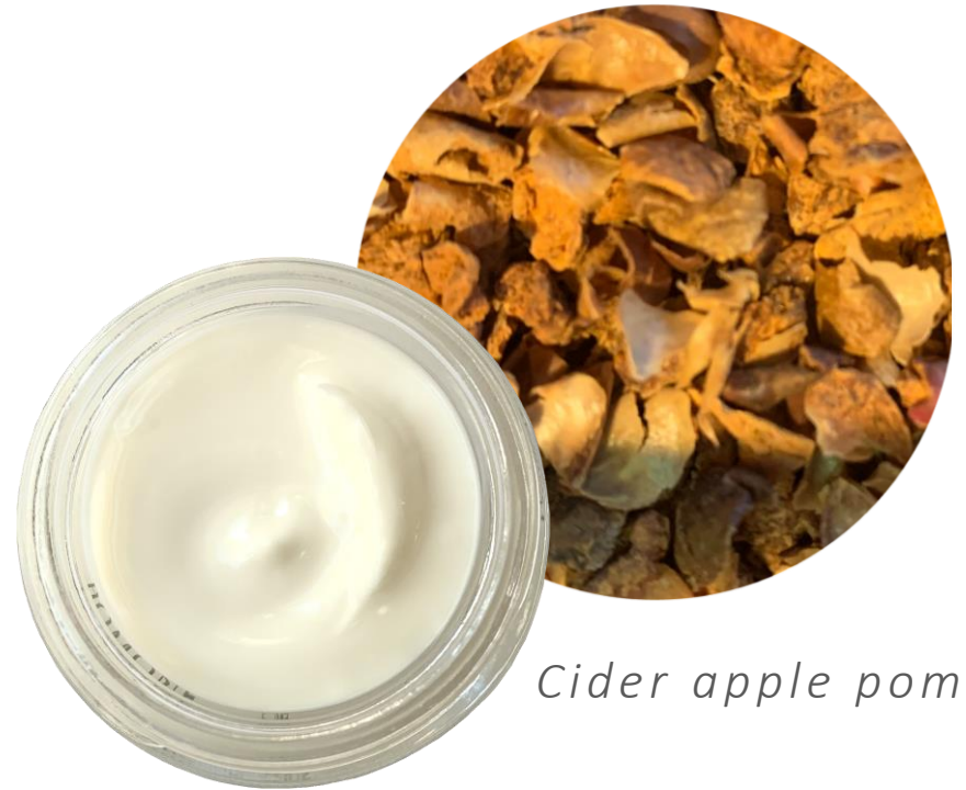
Cider apple pomace

The properties of the apple were reported as early as the 16 th century by Julien Le Paulmier, doctor of King Henry III.