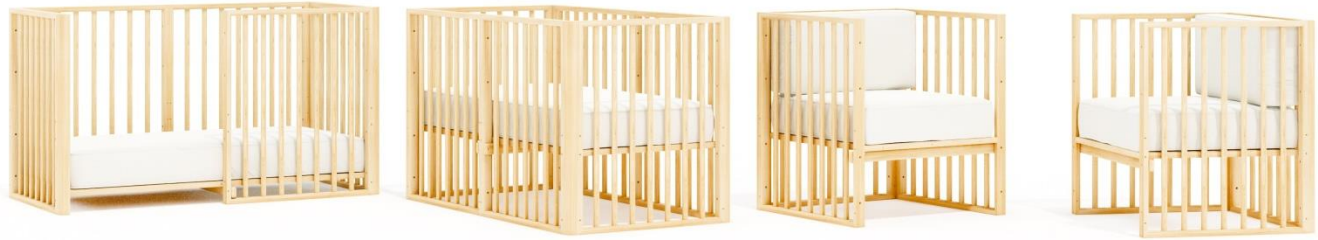
Simpler standard size crib, small bed and armchairs